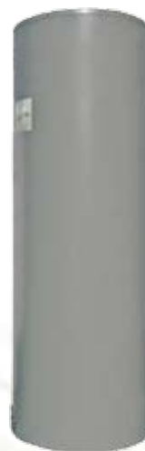
'Solar Power' Copper Lined Tank