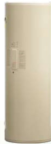
'Solar Power' Vitreous Enamel Tank